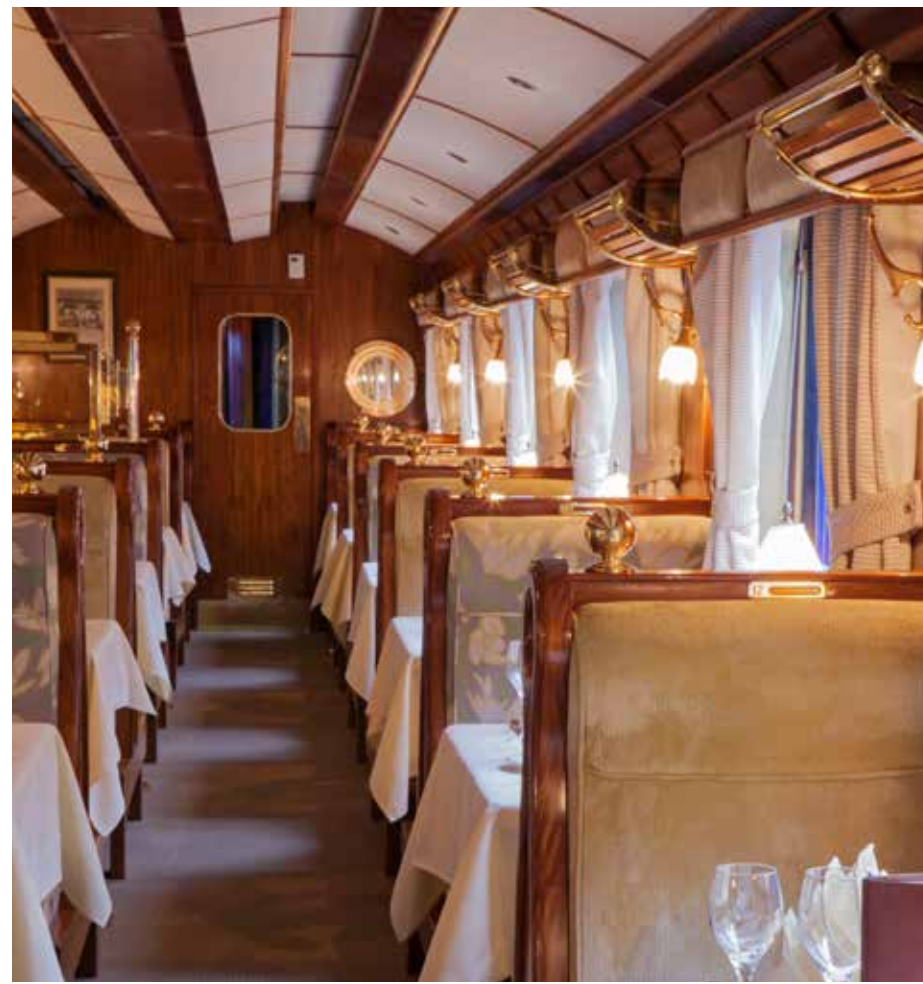
Venice Simplon Orient Express, Luxury Train

Part of the pleasure of life in midtown Toronto is the number of things you can do and see, all within easy walking distance. There are art shows to take in; flagship stores for global brands to visit on Bloor Street; popular restaurants to try; galleries to explore. And once you return home, you want peace, calm and a level of care that is focused on you and what you need to make your day run perfectly. Mizrahi Developments sees that kind of grace and kindness as a form of beauty. How people treat others is essential - and often overlooked in our fast-paced culture. The hospitality at 128 Hazelton is as carefully planned as the interior design. A parking valet and 24-7 concierge look after – and anticipate – your every need to make your home a sanctuary of convenience and restorative calm.