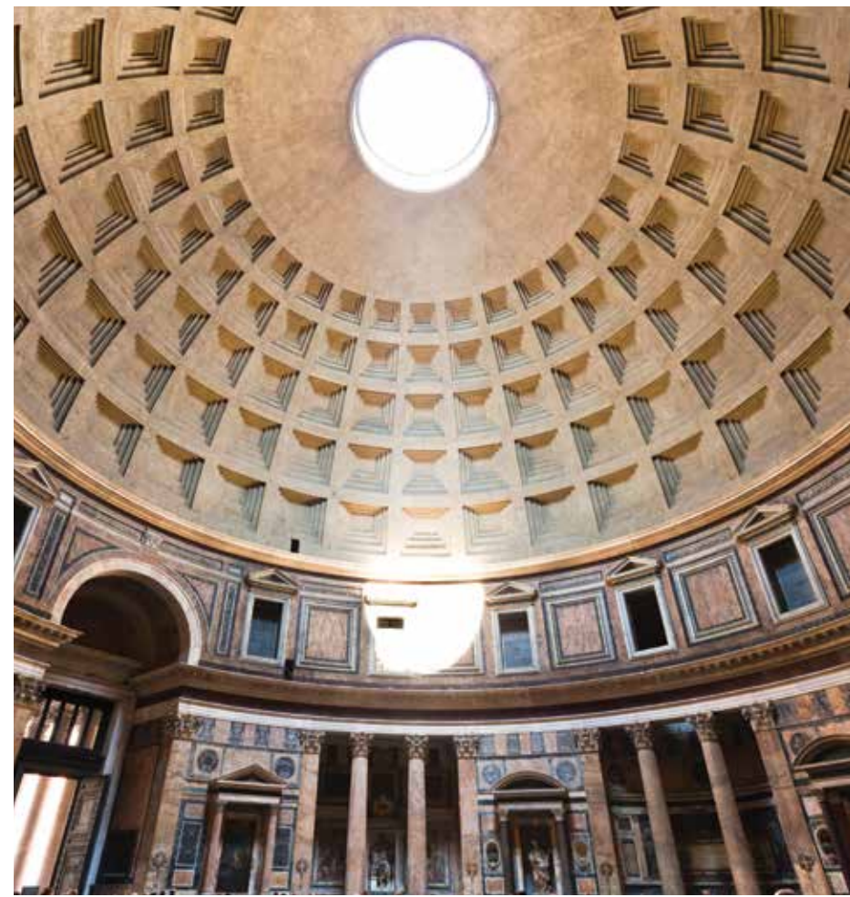
The Pantheon, built in 118-128 AD in Rome, Italy

It often comes as a surprise. You're sitting in a room in your home, and suddenly, a stream of light enters through a window, changing everything. Perhaps the height of the sun has changed in the sky or clouds have magically parted, but however or whenever it arrives, sunlight restores us. The windows in residences at 128 Hazelton, a boutique midrise in Yorkville, are designed to be large to create the healthiest, most inspiring sanctuary. With soundproofing and UV-protection, they allow in light at different times of day and offer expansive views over the heritage midtown neighbourhood.