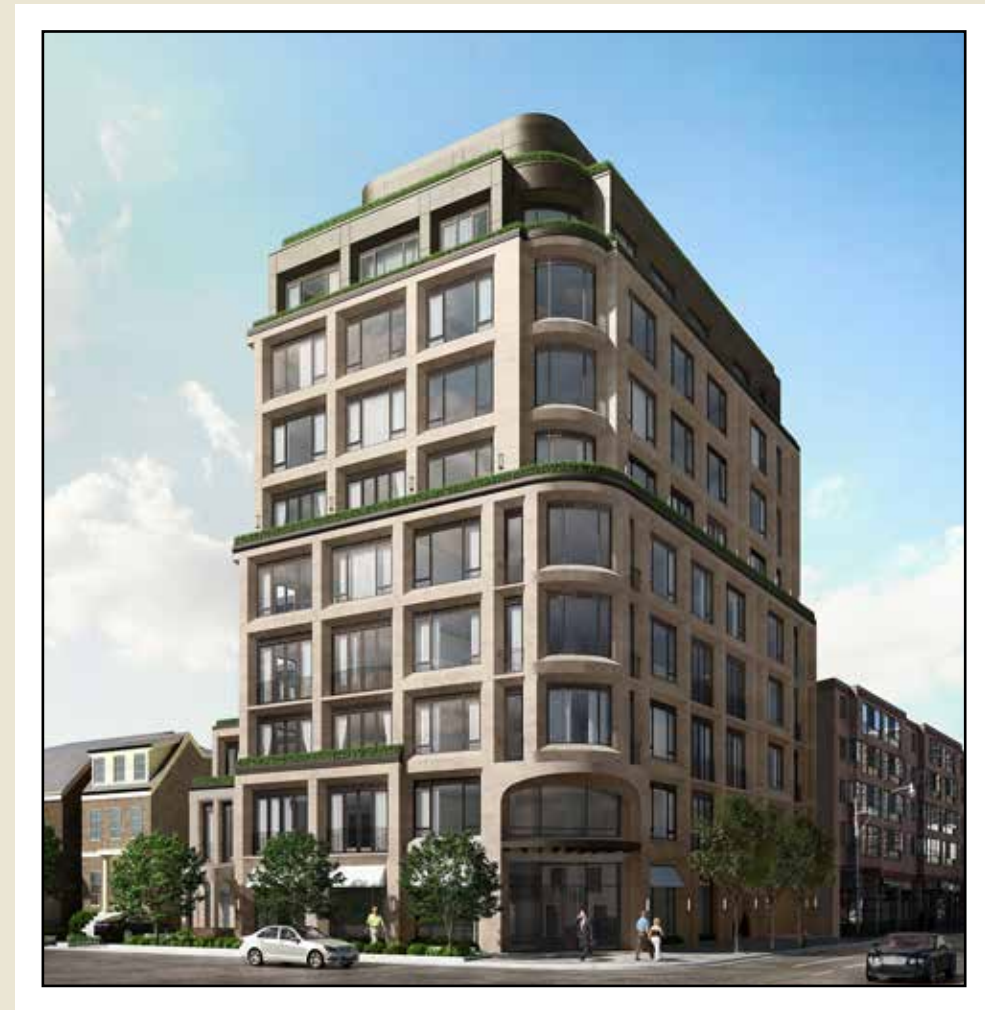
Specifications and features subject to change without notice. E&OE. Illustration is artist's concept. Brokers protected.

At 128 Hazelton, the last of its kind in Toronto's Yorkville neighbourhood, Mizrahi Developments brings old-world craftsmanship and an attention to detail to every aspect of the boutique midrise. 128 Hazelton is a special collection of up to 20 residences, created in celebration of the meaning and importance of beauty in our daily lives.